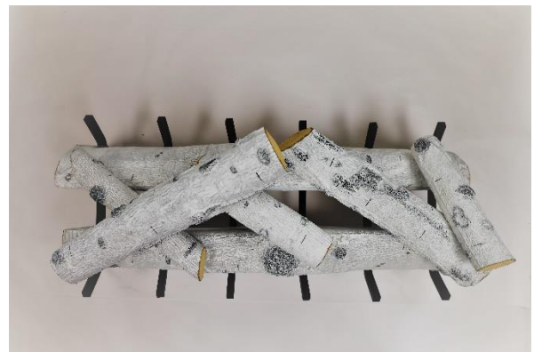
STEP 6 (D)