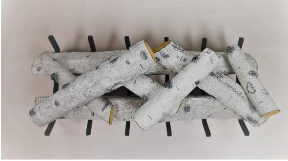
STEP 7 FINAL ARRANGEMENT (B)