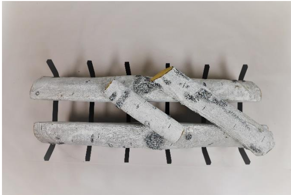
STEP 3 (F)