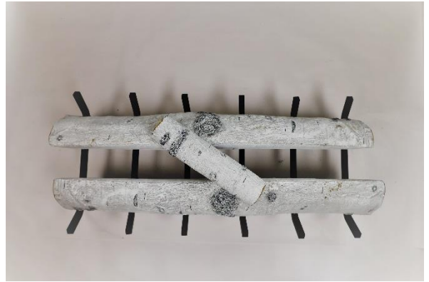
STEP 2 (C)