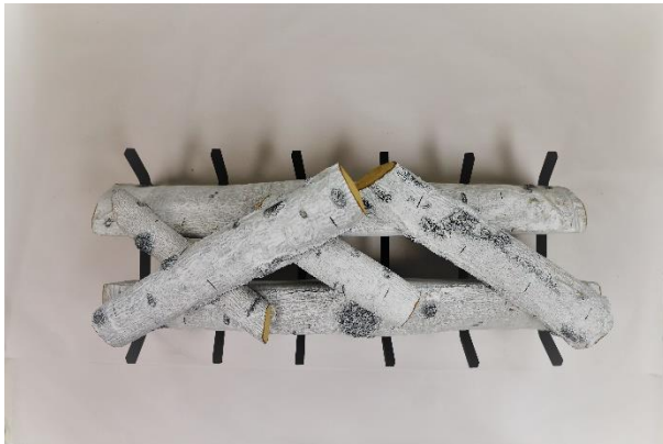
STEP 5 (A)