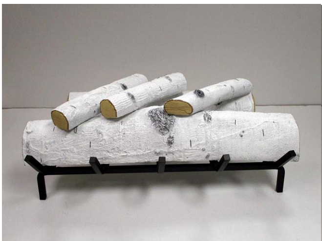
Step 4 (E)