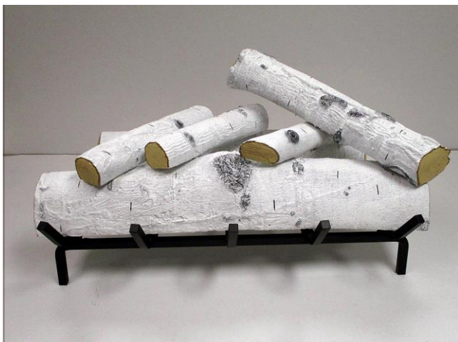
Step 5 (F)