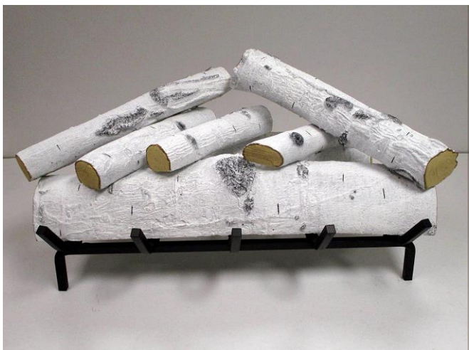
Step 6 (A)