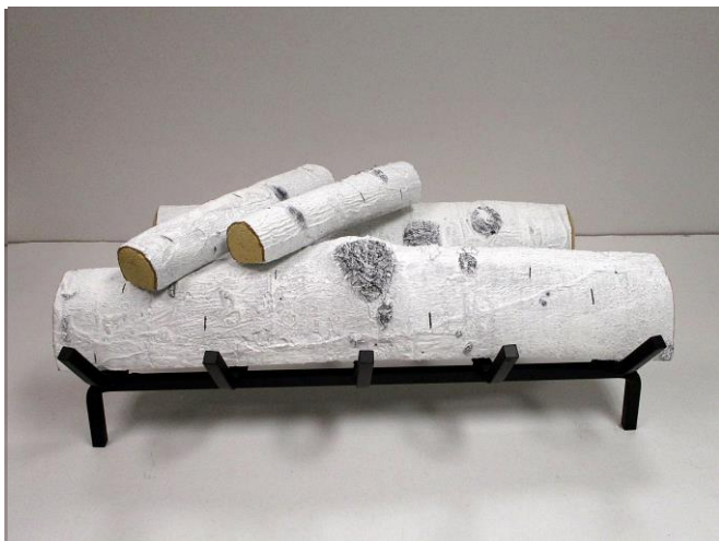
Step 3 (C)