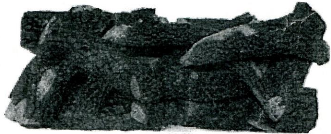
STEP 4 FINAL-ARRANGEMENT