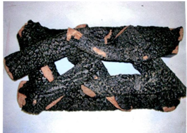
STEP 4 FINAL ARRANGEMENT