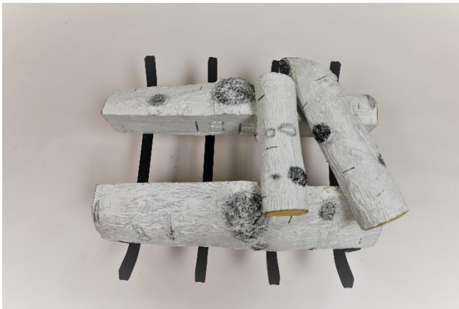
STEP 3 (I)