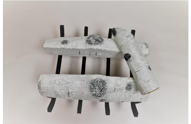
STEP 2 (K)