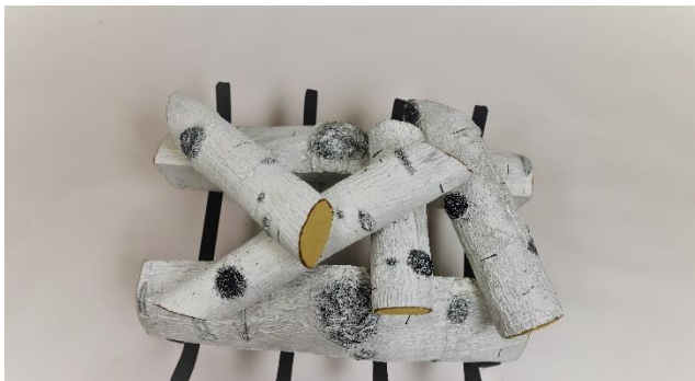
STEP 5 (J)